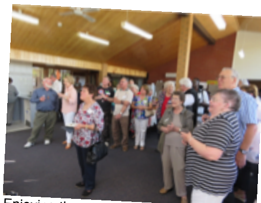
Enjoying the slide show