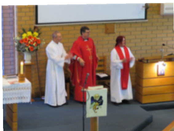
Enjoying the Sudanese singing