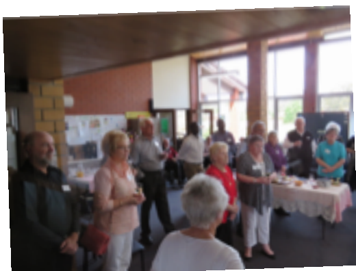
Saturday - being welcomed by the Wardens