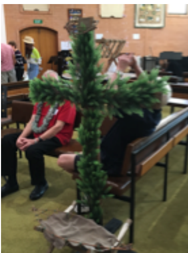
St. Luke's Tree 'From the Cradle to the Cross'