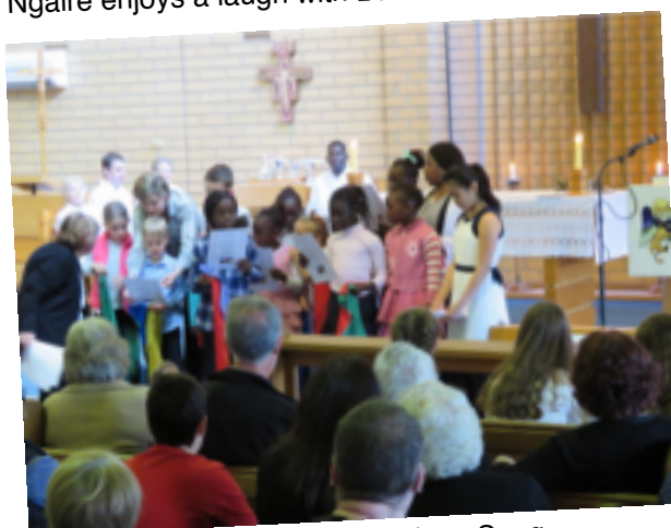
The children singing The Rainbow Song