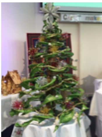
This is entirely from dried plant material