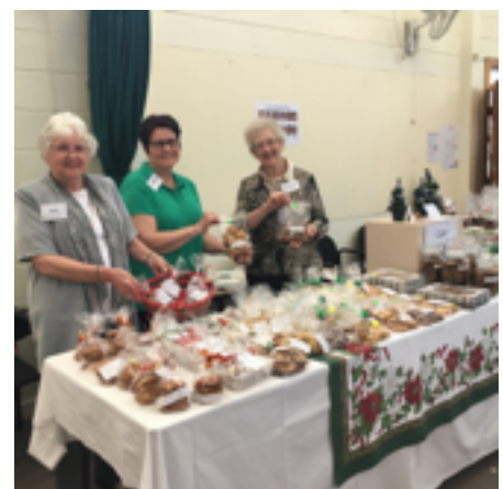
Working on the Cake Stall on Thursday