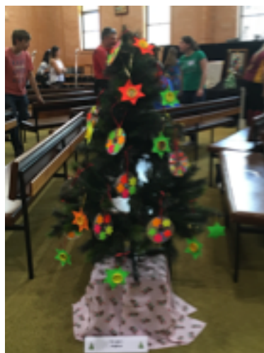
Our Childrens Christmas Tree