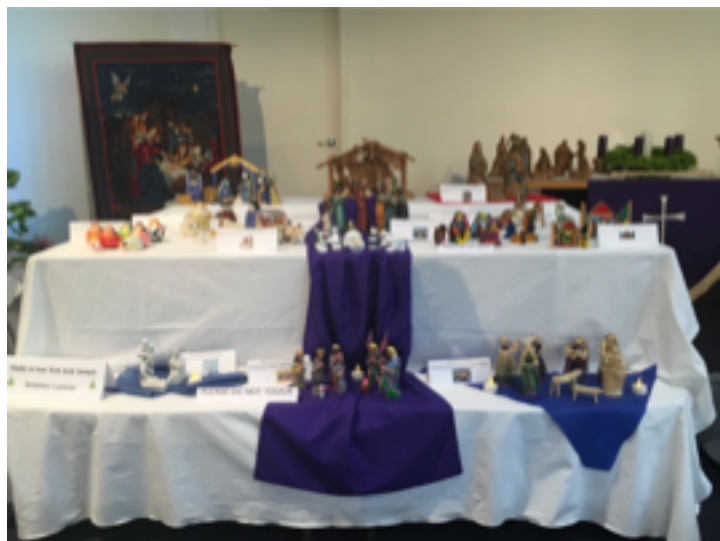
Some Nativity scenes from all over the world