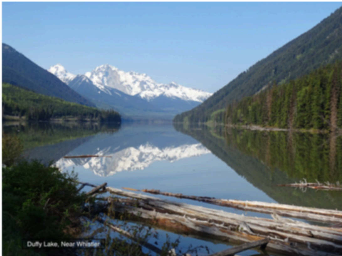
Duffy Lake, Near Whistler

Our tour took us to mainland Canada, via the spectacular Sea to Sky Highway to Whistler and then to Blue River and Jasper in the Rocky Mountains. From Jasper we travelled the Icefields Parkway to Lake Louise and Banff. We were blessed with beautiful weather which complimented the magnificent scenery - snow capped mountains, glaciers, vast forests of fir, pine and hemlock, rapidly flowing streams and rivers, spectacular waterfalls and beautiful lakes. We were lucky to spot brown bears (including 3 different mothers with cubs), elk, longhorn sheep, moose, squirrels, osprey and bald eagles in the wild and to see wild humming birds close up. A 25 minute helicopter flight over the Rockies from Banff gave us a taste of how expansive and spectacular the magnificent Canadian Rockies are.